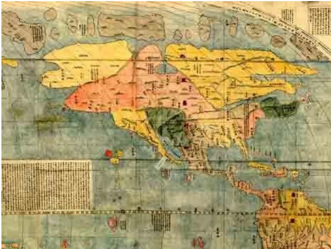
Kunyu wanguo quantu, or Map of the Ten Thousand Countries of the Earth 1602

Matteo Ricci, Li Zhizao, and Zhang Wentao in the collection of the James Ford Bell Library University of Minnesota